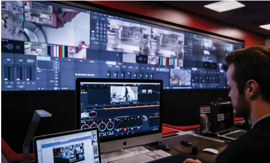
▲ G9MD's command center includes a video wall comprised of 64 Christie MicroTiles. The wall shows videos of surgical procedures, presentations and educational content to be broadcast within a hospital's network, or live-streamed worldwide using G9MD's technology and platform.