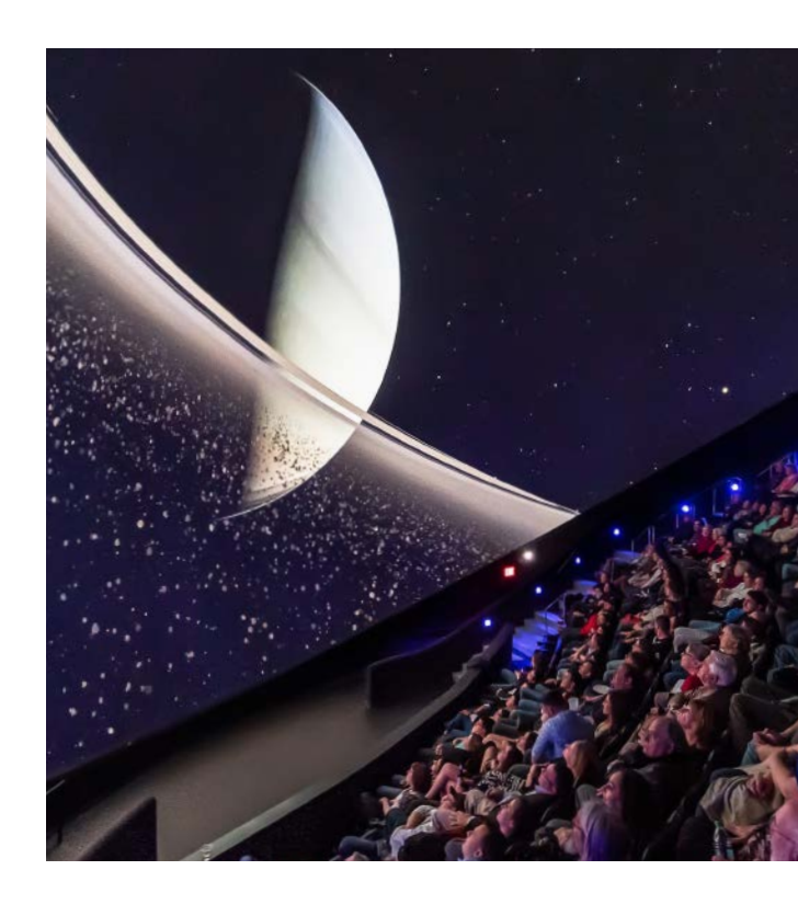
→ US Space and Rocket Center