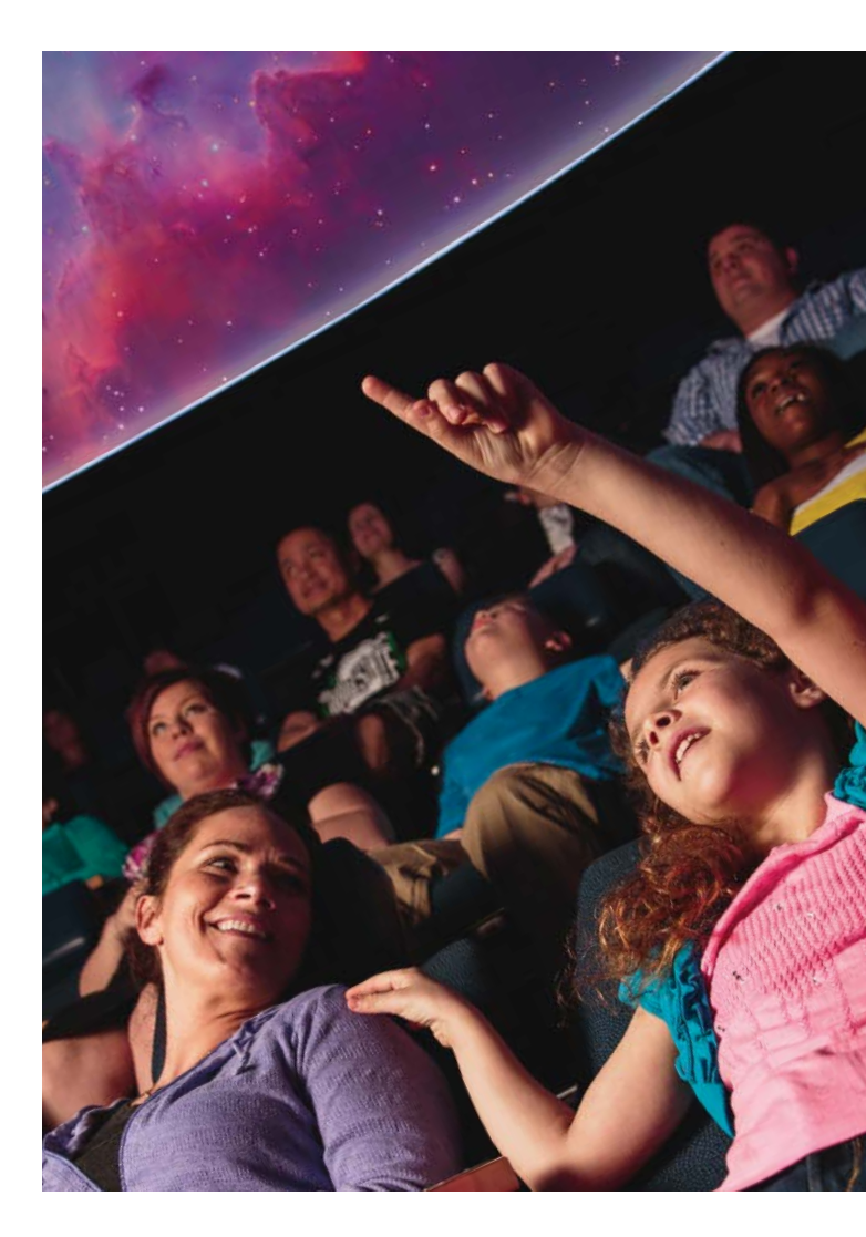
▲ COSI Planetarium